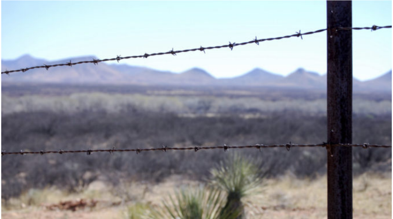
Barbed-wire fence at Mexico border

Today we have smugglers bringing people and drugs over our southern border. In a SHTF environment, we're likely to have these same people coming across our borders just for a different reason.